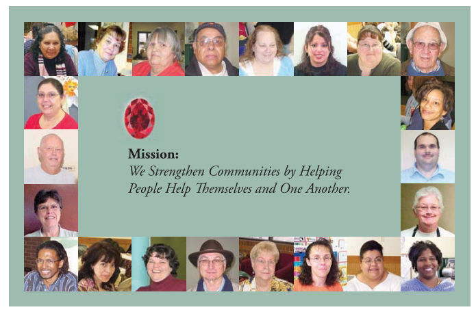
Project NOW celebrated their 40th Year on October 9, 2008 at Watch Tower Lodge in Black Hawk State Park, Rock Island, IL.

Small business development is just one of the ways in which we show every day that Community Action works ... by strengthening communities.