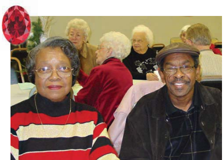
Since Senior Services programming started in 1975, we have served over 3 million meals and have provided over 700,000 rides to seniors.